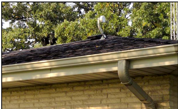
Typical HCN Rooftop Antenna Installation

HierComm Networks Residential and Business Services offer a true wireless broadband Internet connection, with standard plans up to 10 Mbps and custom plans above this.